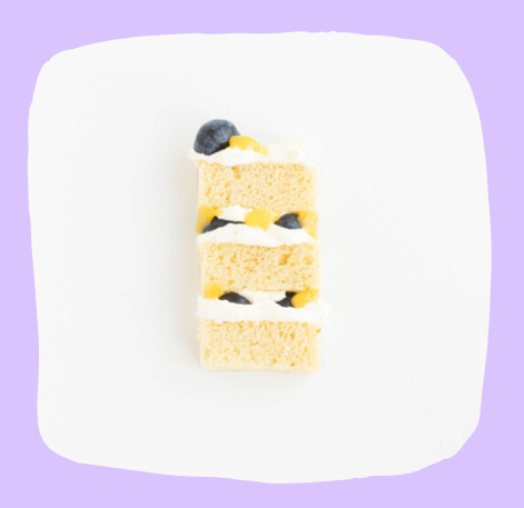
LEMON + BLUEBERRY

Tangy lemon curd meets fluffy swiss meringue buttercream layered with a delicate vanilla cake, delivering a citrusy vibe perfect for those warmer months.