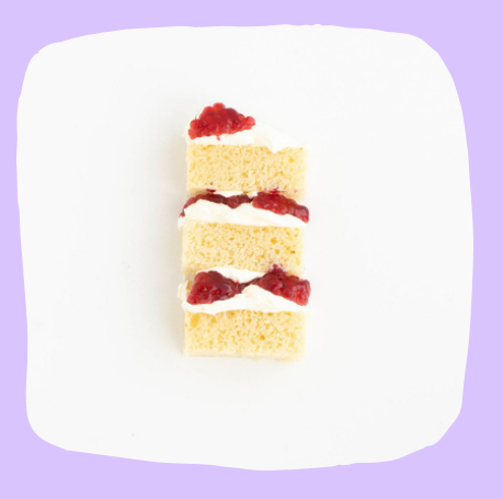
WHITE CHOC RASP

cake, hazelnut praline and a subtle crunch of roasted hazelnut.