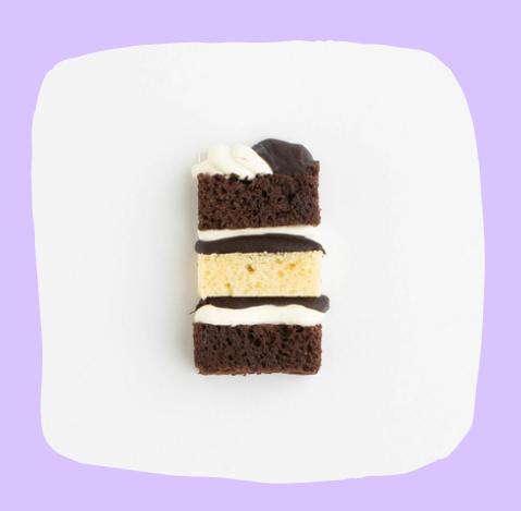
CHOC + VANILLA

A vanilla cake layered with a zesty lemon curd + blueberry coulis, a perfect balance of tart + sweet.