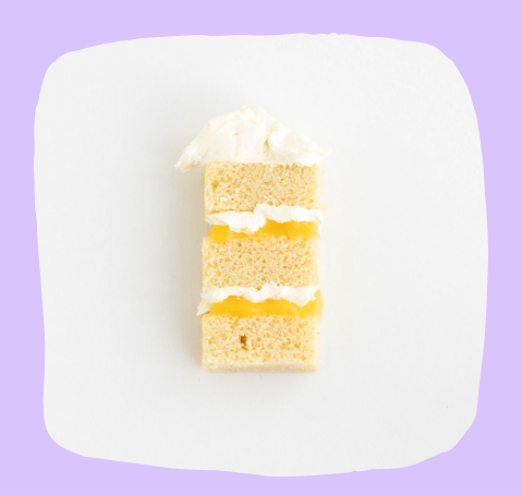
LIME + BASIL

A classic and timeless flavor that never goes out of style, featuring a vanilla cake base with a swiss meringue buttercream filling.